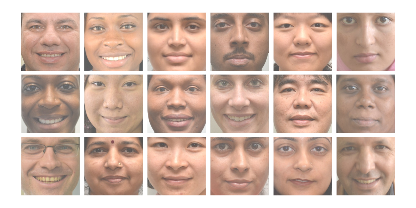
June 2012 ANNUAL REPORT