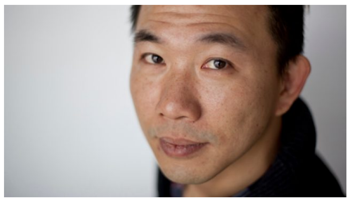
By Nicholas Keung Immigration reporter Mon., Nov. 9, 2015 | 页3 min. read